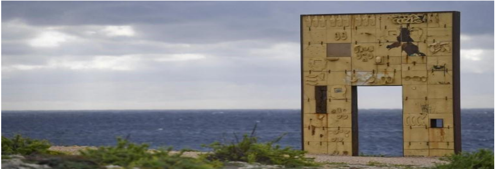
"The Door of Europe" Monument to migrants on the Italian island of Lampedusa.